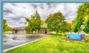
Norma Miller The Family Place 10 N. 600 E. Hyrum, UT 84319