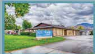
Smithfield The Family Place 502 S. Main St. Smithfield, UT 84335