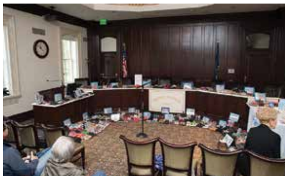
403 pairs of children's shoes, each representing a substantiated case of child abuse in Cache and Rich Counties. This is our Steppin' Up for Children event.