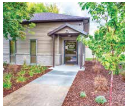
Norma Miller, The Family Place 10 North 600 East Hyrum, Utah