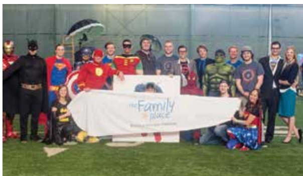
Superheroes of all ages flew into our unique Superhero Training Camp. Popular superheroes oversaw many activities and crafts.