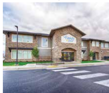
Belva Hansen The Family Place 1525 North 200 West Logan, Utah