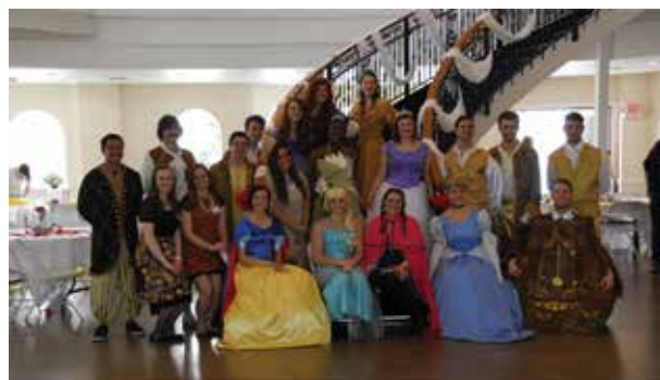
Young princesses journeyed from near and far to meet their favorite princesses and participate in games and crafts.