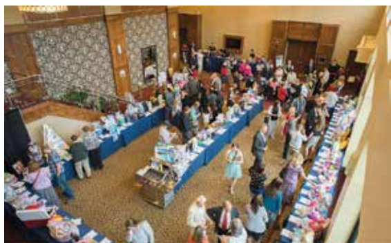
The Dinner and Auction is our biggest fundraising event of the year. This year's theme was "An Evening At Sea".

The Family Place is proud to report that the 2016 dinner and auction was the most successful fundraiser that we have had in our history. Funds raised were over double than in the past. We express our gratitude to our community for their support.